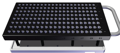
Collection Rack for 12 x 32 mm HPLC Vials